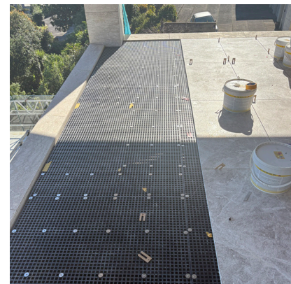
Prograte Tile and Turf Sheets. PF.TG.18x12x15